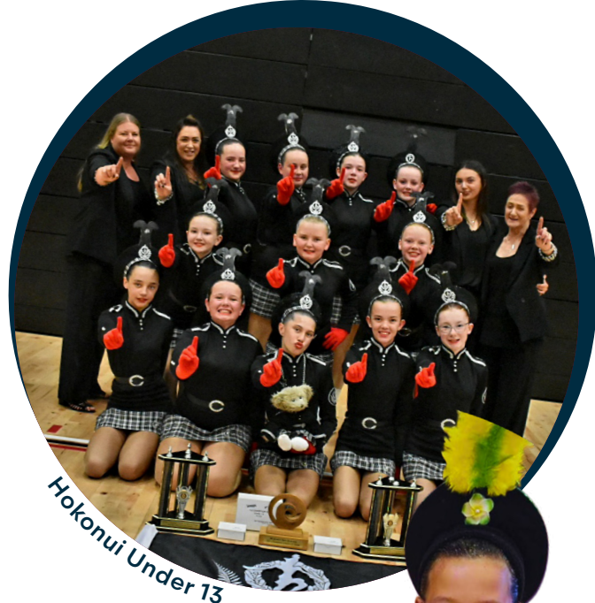
Hokonui Under 13