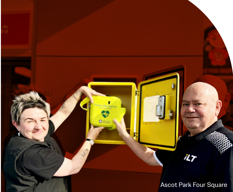
Ascot Park Four Square