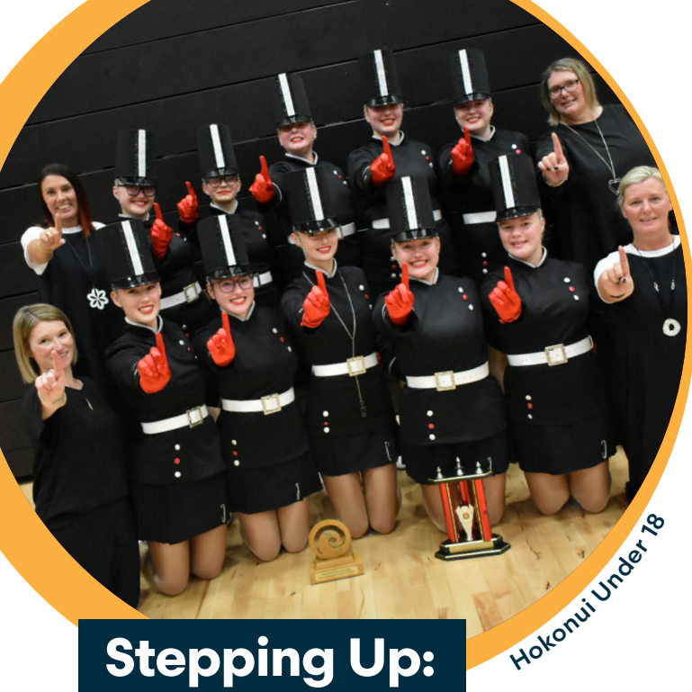
Hokonui Under 18